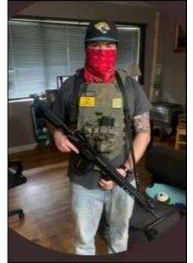
FB Screen Shot

https://www.facebook.com/luismiguelSJCFL/posts/636922510270139